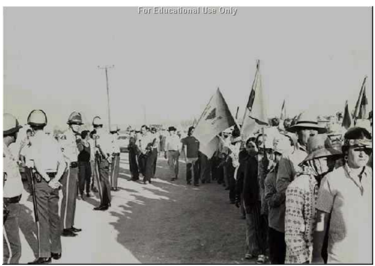
Picket line at grape strike in Coachella in 1973.

Hundreds of people of all colors and faiths came to Delano to help with the grape strike. Many churches of all different faiths supported the strike. César thought that all religions were very important and he welcomed their support. The national media (television crews, news papers reporters, and writers for magazines) covered the use of violence by the growers against the nonviolent striking farm workers. NBC aired a documentary called "The Harvest of Shame" that showed how farm workers were forced to live in poverty. Millions of Americans and political leaders saw that César was fighting for the justice that America promises all of its citizens. Other labor unions supported the strike. César called for a national boycott of grapes, during a boycott the growers loose money because in a boycott people stop buying the food that the growers sell in the supermarkets. Eventually the growers are forced to negotiate with the farm workers. César believed that the American people had a sense of justice and he was right. Millions of Americans supported the boycott and stopped buying grapes because they understood the injustices that the farm workers suffered.