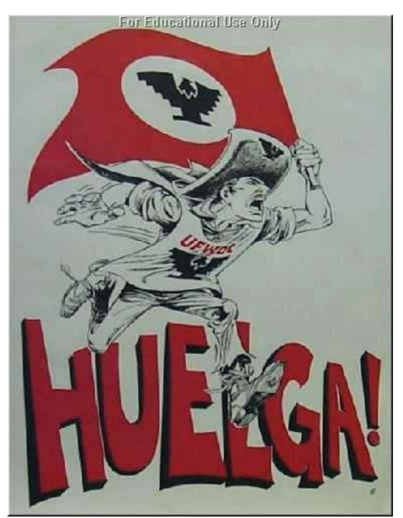
Poster Copyright United Farm Workers United Farm Workers Organizing Committee's Huelga poster.