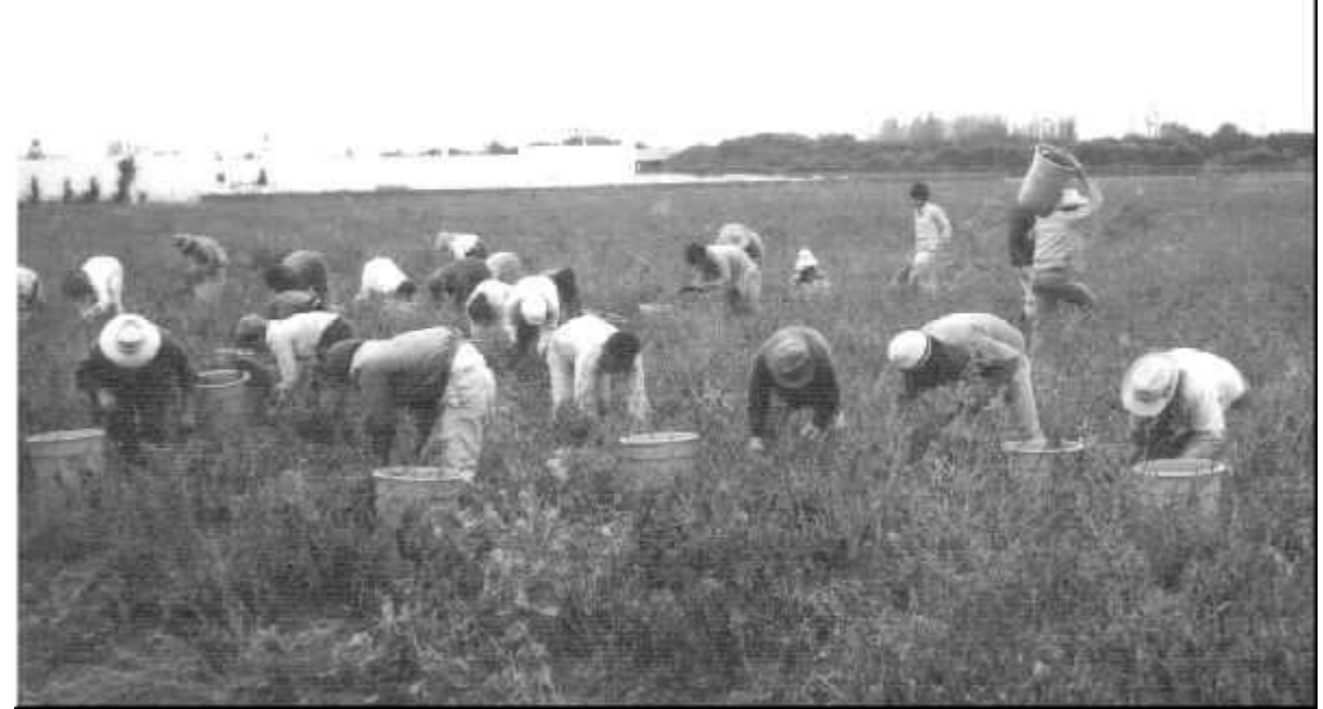
For Educational Use Only