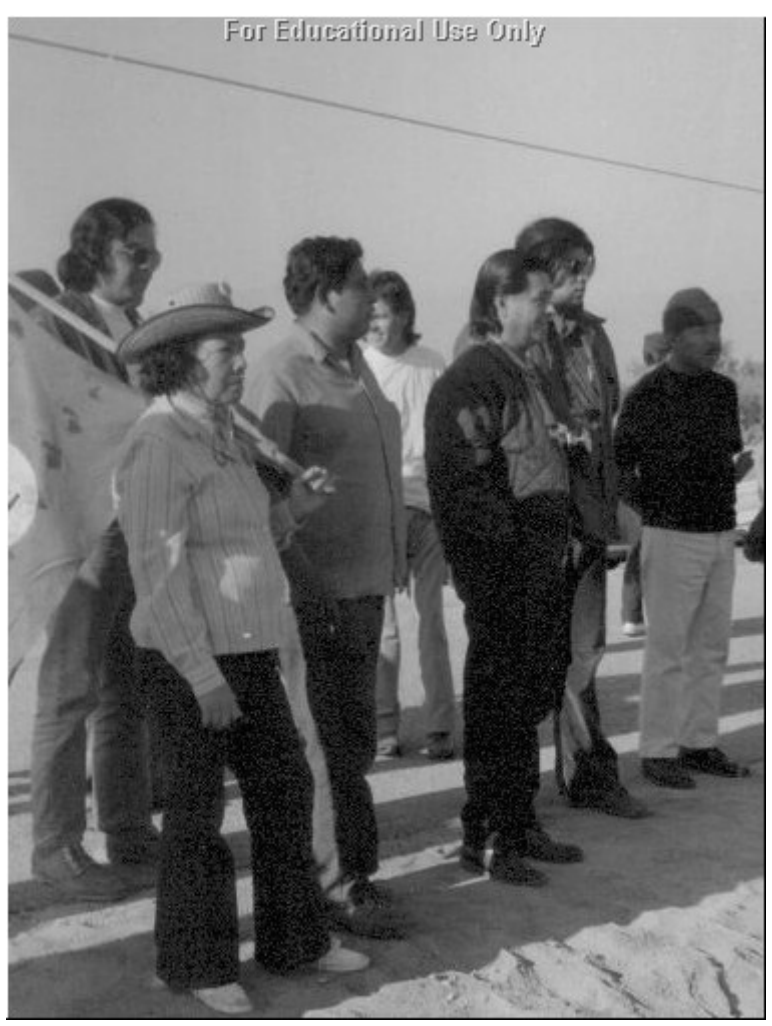
César (in the dark jacket) with farm workers on the picket line during 1973 Grape Strike.

"It's ironic that those who till the soil, cultivate and harvest fruits and vegetables and other foods that fill your tables with abundance have nothing left for themselves." César E. Chávez